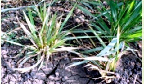
Leaf yellowing and stunting symptoms in durum wheat genotypes : HI 8713 (left) and PDW 233 (right)