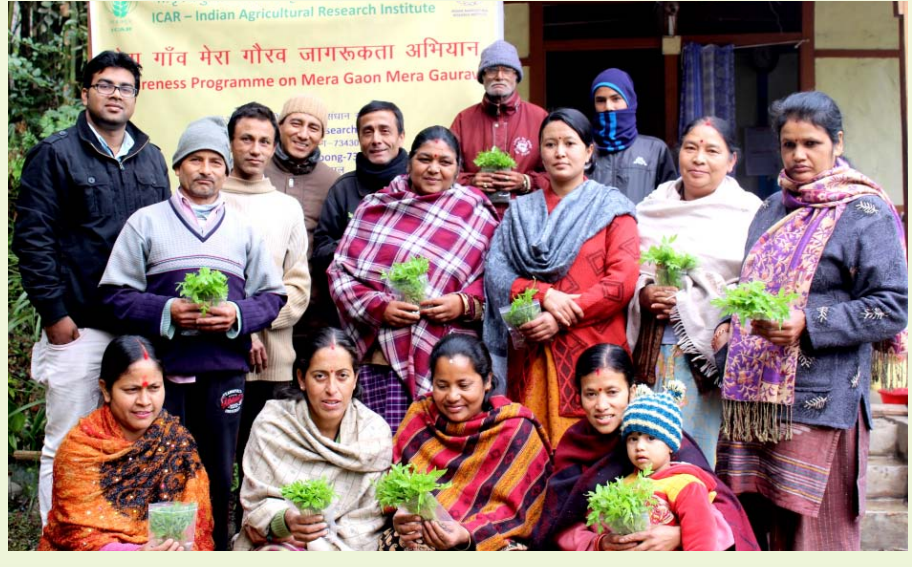
Distribution of tomato seedlings of Pusa Rohini variety during "Mera Gaon Mera Gaurav" programme

of varieties/hybrids, exotic vegetables and production systems developed by the Institute were demonstrated in the vegetable demonstration unit so that farmers and amateur gardeners can see themselves potential of technologies. An exhibition of various fresh vegetable products from divisional varieties/hybrids and scientific information about these were also displayed for the awareness about health and nutritional benefits as well as means of higher income and profit in shorter duration. Farmers from Delhi and neighbouring states of U.P., Haryana, Rajasthan, Punjab, Himachal Pradesh and Uttrakhand participated in large number, highest ever before (around 700) in the Mela. Other attractions of the Mela were vegetable seed sale counters, Biofertilizers, Post Harvest Products, etc. Literature on package of practices was made available to farmers and amateur gardeners.