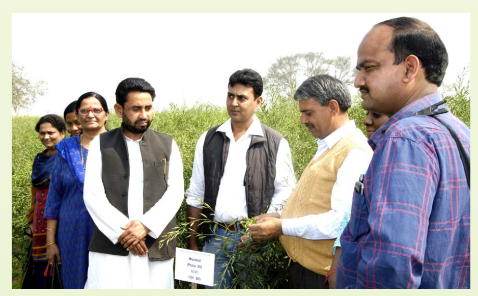
Scientists interacting with farmers while explaining importance of mustard variety, Pusa\ 30

IARI organized Field day on mustard variety Pusa 30 at