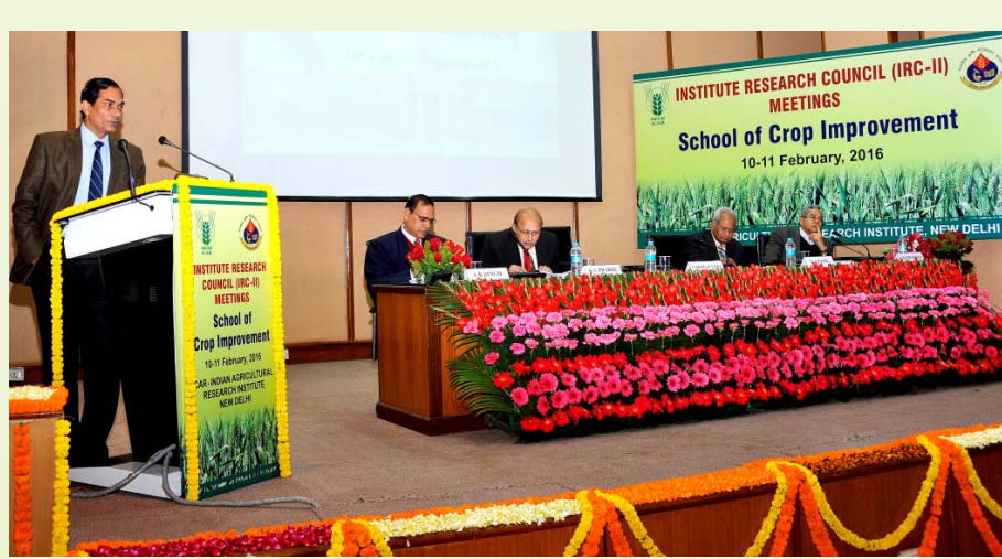
Institute Research Council (IRC-II) meeting