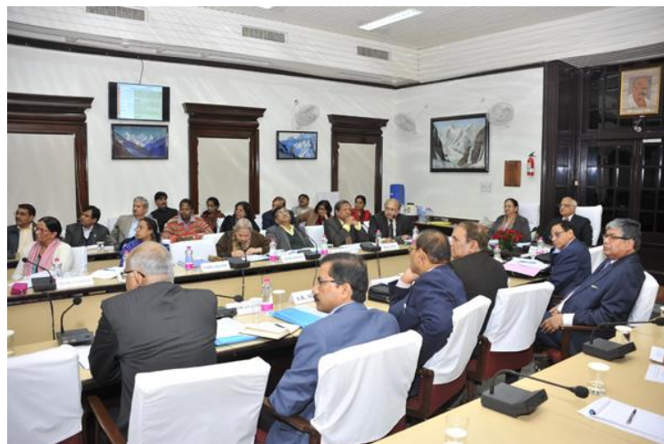
RAC meeting in the Library Conference Hall of IARI